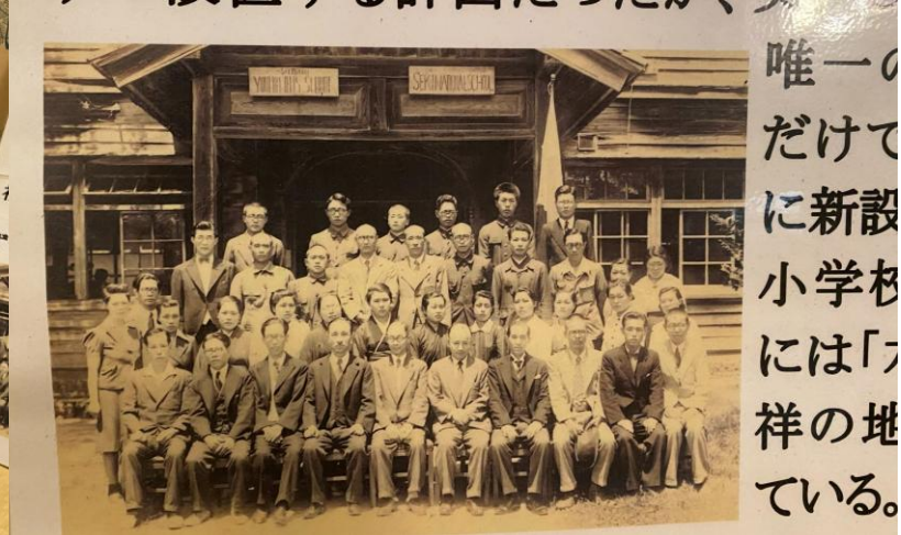
The people concerned with the establishment of the first Japan Educational System and its School.